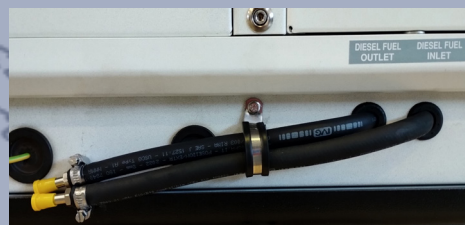
INPUT/OUTPUT FUEL PIPE

the engine is cooled by a coolant loop in a closed circuit. The system consists of a heat exchanger, inside which the heat exchange between coolant and sea water takes place. Two separate pumps provide for the circulation of coolant and seawater. Air flows ensure effective cooling of the alternator.